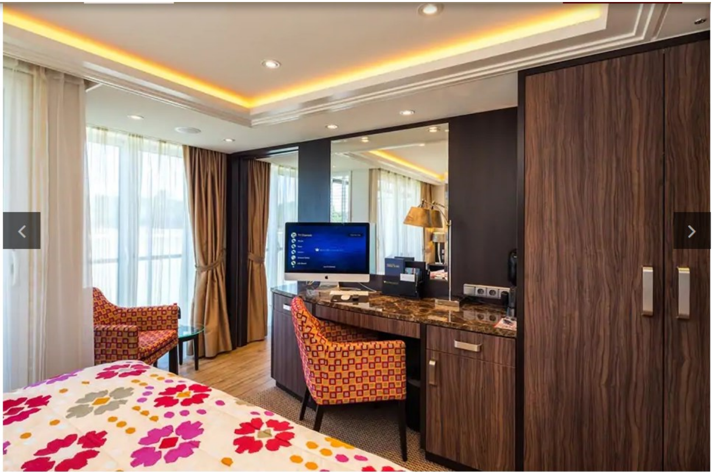
Double Balcony Stateroom (BB) (210) sq. ft