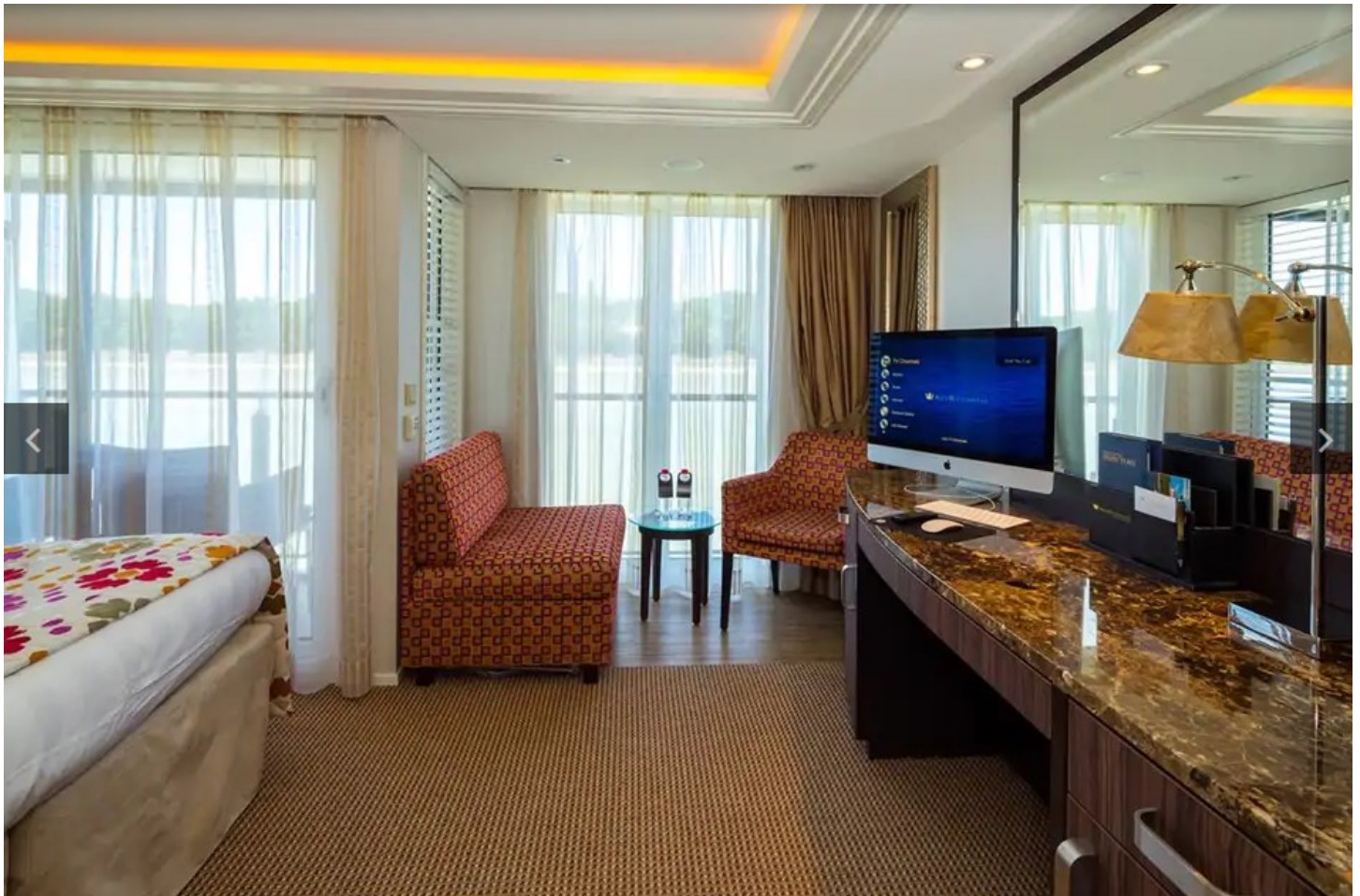
Double Balcony State Room (AB) (235 sq ft)

Elevator reaches Main Restaurant, Lobby/Main Lounge and staterooms on Violin and Cello Deck.